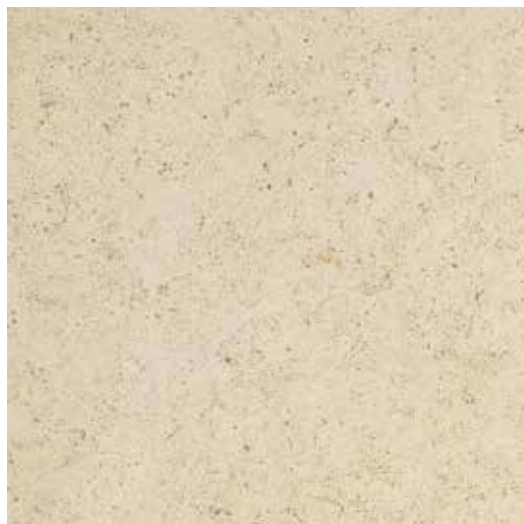
Porto Beige® (Honed) 12" x 12" x 3/8", 16" x 16" x 3/8", 24" x 24" x 3/4", Slab