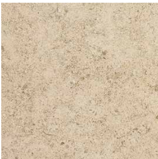
Gascogne Beige (Honed) 12" x 12" x 3/8", 16" x 16" x 3/8", 24" x 36" x 3/4", Slab