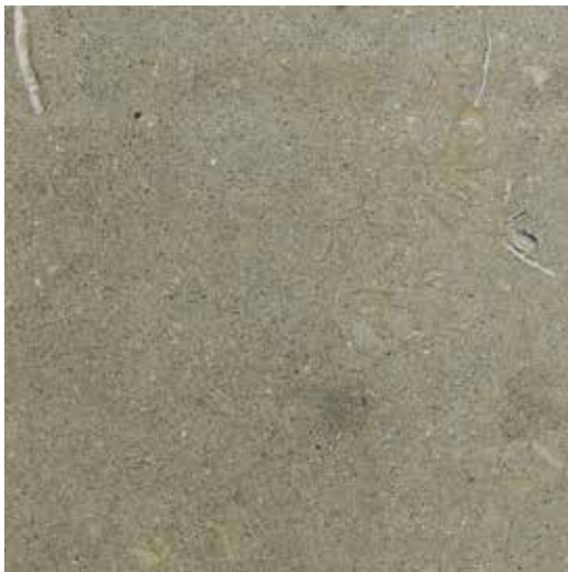
Seagrass (Honed) 12" x 12" x \frac{3}{8} ", 18" x 18" x \frac{3}{8} ", 16" x 24" x \frac{3}{8} ", 24" x 24" x \frac{1}{2} ", Slab