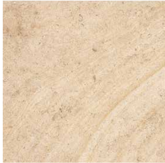
Beaumaniere Light (Honed) 16" x 16" x 5/8", 12" x 24" x 5/8", Slab