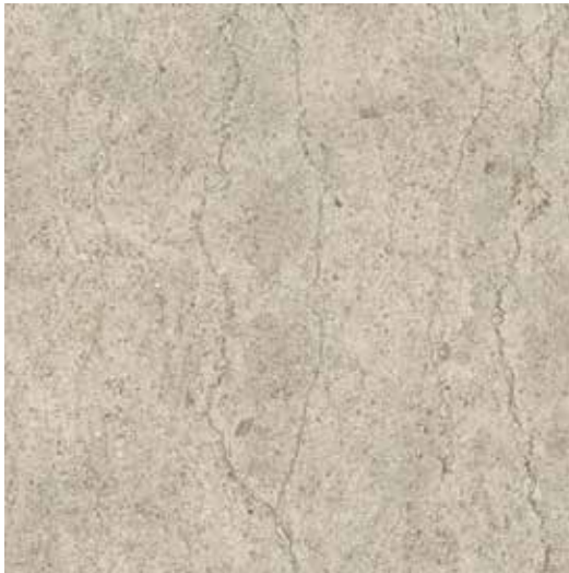
Gascogne Blue (Honed) 12" x 12" x \frac{3}{8} ", 16" x 16" x \frac{3}{8} ", 12" x 24" x \frac{3}{8} ", 24" x 36" x \frac{3}{4} ", Slab