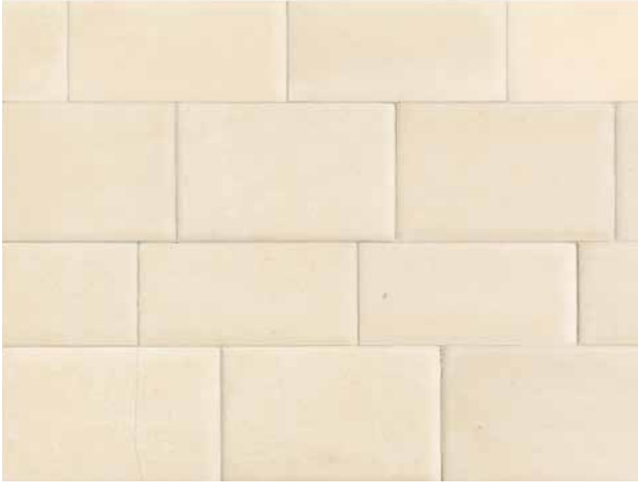
Cotswold Cream – 12" x 24" x 1/2", 16" x 24" x 1/2" Honed and pillowed with gently rusticated edges.

Reminiscent of the creamy antique English limestone found in abodes both humble and grand, Cotswold Cream boast hues that range from creamy ivory to golden linen. Hand pillowed and slightly distressed at the edges, Cotswold Cream will lend authentic elegance to any interior.