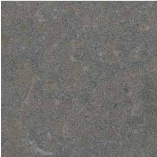
Lagos Azul (Honed) 12" x 12" x 3/8", 16" x 16" x 1/2", Slab