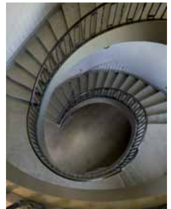
Both pages Floor: London Grey 16" x 16". Custom Floor Pattern: London Grey 16" x 16", Lagos Azul 16" x 16" and Calacata Luna Marble 18" x 18" Honed. Stair: London Grey Slab.