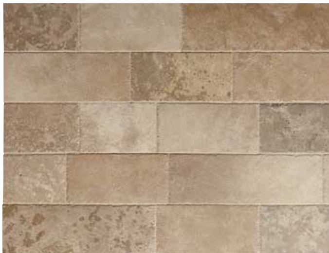
Bordeaux Pavers – 8" x 12", 8" x 16", 8" x 24", all sizes \frac{3}{4} " thick – Sold as a pattern only. Antiqued surface with rustic edges.

These splendid paving stones originate in the Bordeaux region of France, renowned for its limestone chateaux surrounded by prized vineyards. Local quarries yield blocks of grey, gold, cream and buff stone that are then selected and worked to our exacting specifications.