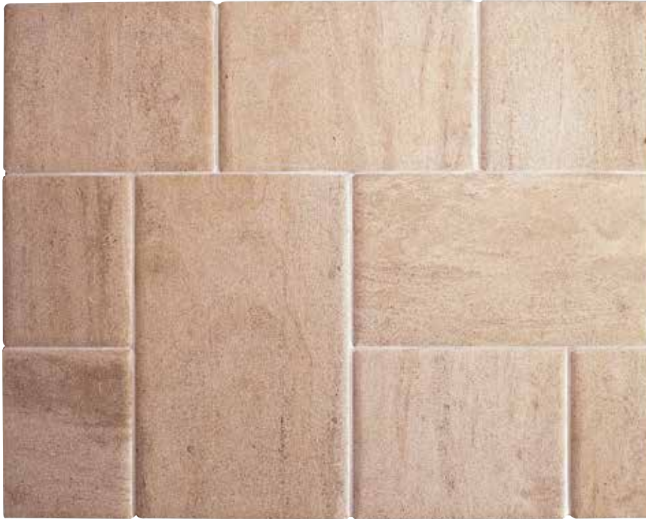
Versailles Pattern in Beaumaniere Classic – Composed of 9 different tile sizes, – Thickness \frac{3}{4} " Honed surface with pillowed edges.

The epitome of luxurious flooring, the Versailles pattern is hand crafted from our exclusive French Limestone, and is a Walker Zanger classic.