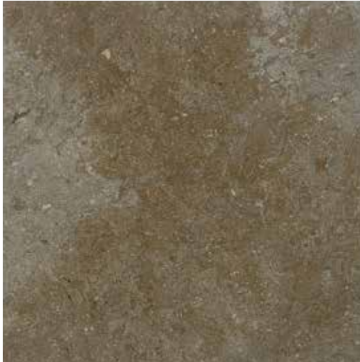
Chestnut Brown (Brushed) 12" x 12" x \frac{3}{8} ", 16" x 16" x \frac{3}{8} "