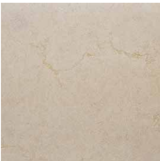
Medina Stone (brushed) 12" x 24" x 3/8", 24" x 24" x 1/2"