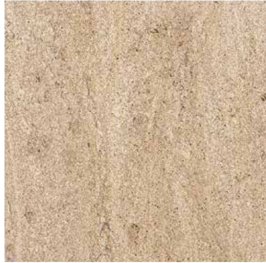
Beaumaniere Classic (Honed) 16" x 16" x 5/8", 24" x 24" x 3/4", Slab