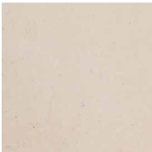
Antium Limestone 12" x 24" x 3/8"