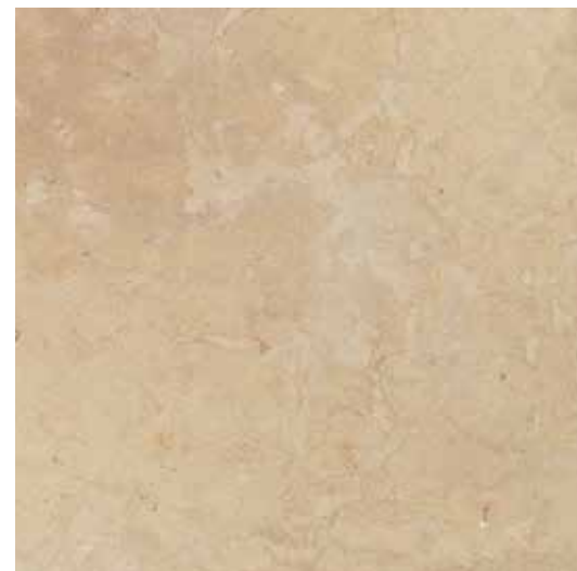
Lagos Gold (Honed) 18" x 18" x 5/8"