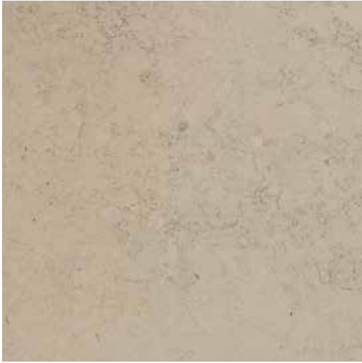
London Grey 12" x 24" x 3/8" 16" x 16" x 3/8", Slab