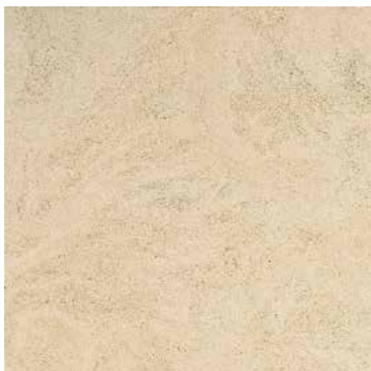
Alhambra (Honed) 12" x 12" x 3/8", 16" x 16" x 3/8", 24" x 24" x 3/4", Slab