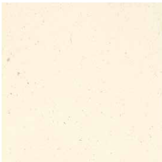
Paloma (Honed) 18" x 18" x 3/8", Slab