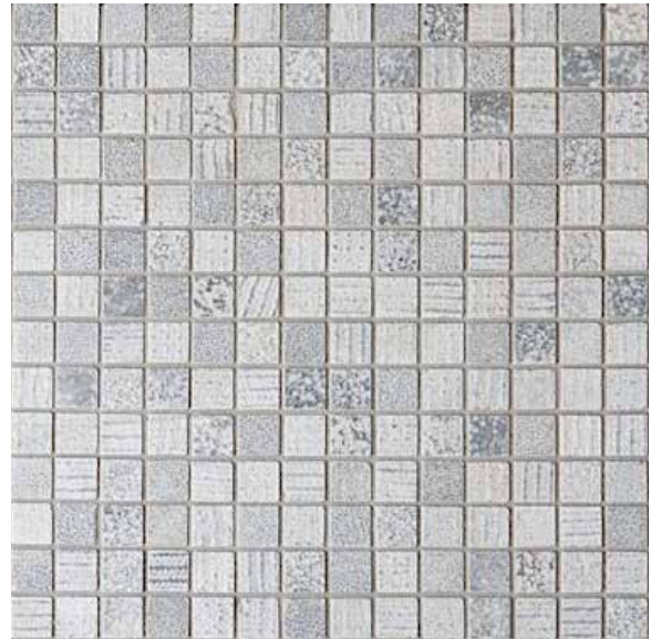
Mosaic 1" x 1"