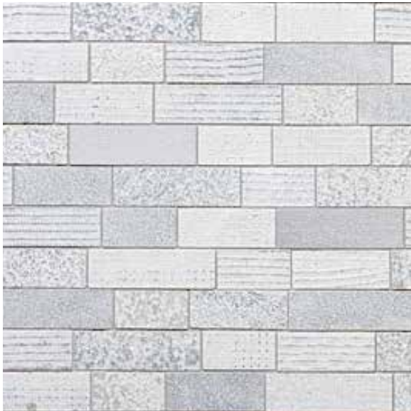
Brick Mosaic, Textured 1 1/2" x 3", 4" 5"