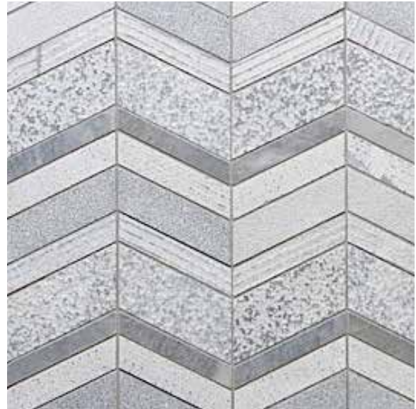
Chevron Mosaic 4 1/2" x 3/4", 1", 1 1/2", 2 1/4"