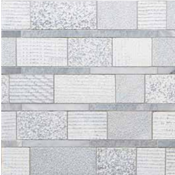
Stripe Mosaic 2 1/2" x 2 1/2", 3 1/2", 6"

Combining multiple textures of stone in a variety of geometric shapes, the Shift Collection changes our perception of stone as a decorative surface. Chiseled, scrapped and hammered, the stone surfaces shift from one texture to another in an almost lyrical fashion, creating visual interest that changes with the play of light and shadow.