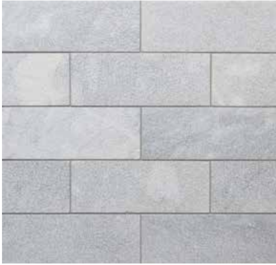
Hammer Field 3" x 8"