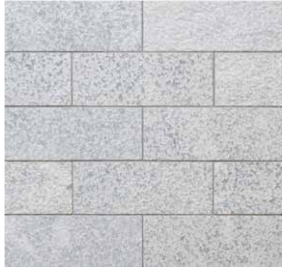
Blast Field 3" x 8"