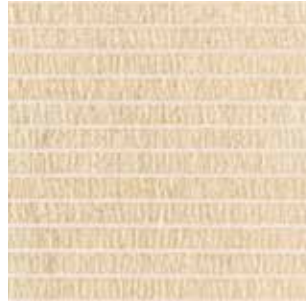
Straight Set Mosaic 1/2" x 9" Mesh Mounted