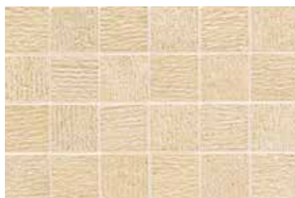
2" x 2" Mosaic Mesh Mounted

Tatami's unexpected texture was inspired by the woven floor mats traditionally found in Japanese homes. Applied to limestone by highly skilled craftsmen, this surface conjures a beguiling visual softness while maintaining all the durability of stone. Tatami is offered in a variety of forms, from oversized tiles to elongated mosaics and is perfectly suited for Zen, Modern or Spa inspired spaces.