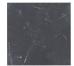
Balcony Black Marble