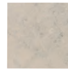
Tuscan Taupe Limestone