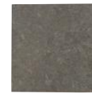
Gateway Grey Limestone