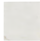
Windsor White Marble