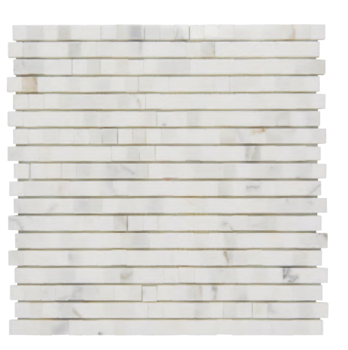
CALACATTA OLD WORLD FIELD 20ANCALOWF