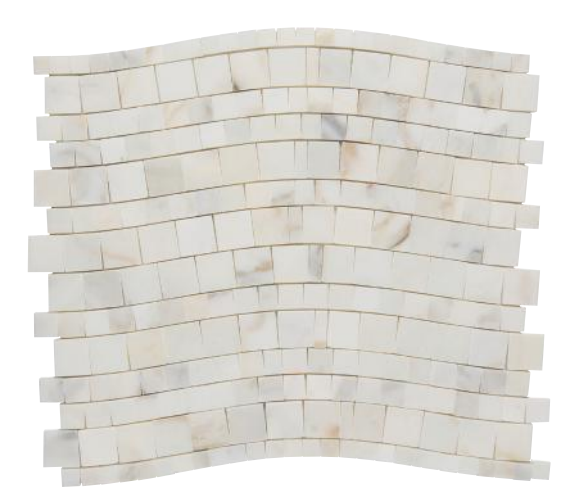
CALACATTA ONDA PATTERN 20ANCALOP1416

Opus Anticato" Old World Field is not recommended for shower floor application. For installation on shower floors, please refer to TCNA guidelines and consult with your installer for proper waterproofing and sealing requirements. We recommend sealing all natural stone products with a penetrating sealer and sealing all porous non-polished stone (limestone, tumbled marble, etc.) prior to grouting. Stone is a natural product, and care should be taken to protect it from harsh abrasive cleaners and abrasive cleaning tools. For further questions/information about usages, please consult with your installer.