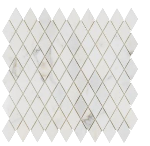
CALACATTA GOLD DIAMANTE 20ANCGODIA