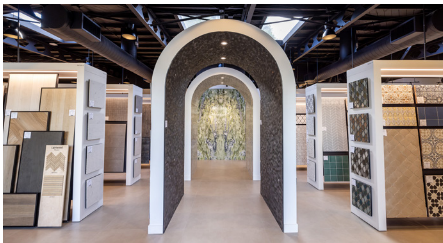
CLOCKWISE: Outside the Walker Zanger showroom located in the heart of West Hollywood; the new fluted marble tile collection; inside the West Hollywood showroom; the San Leandro showroom offers an expansive collection of slabs.